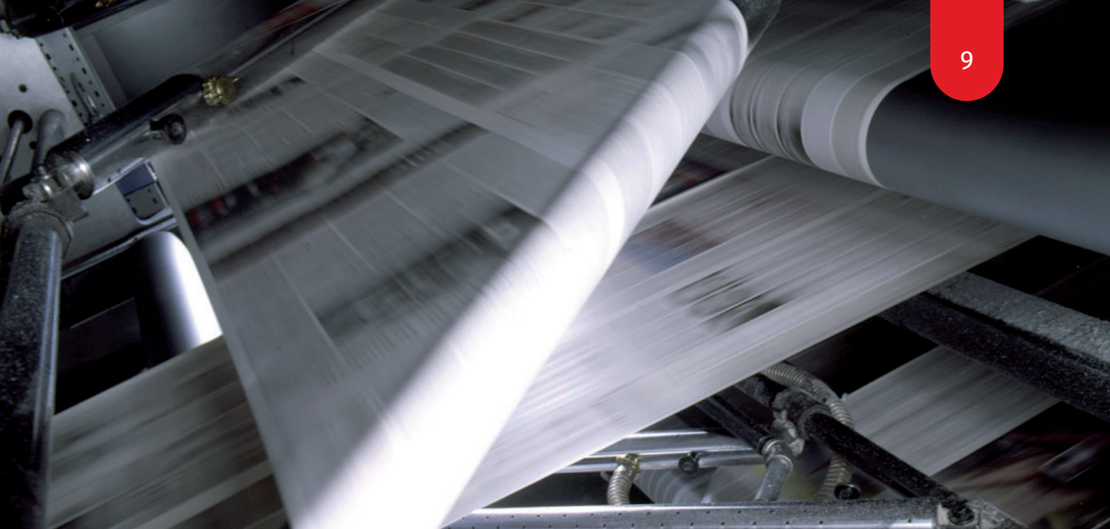
Pic: Printing machine KBA „Commander“